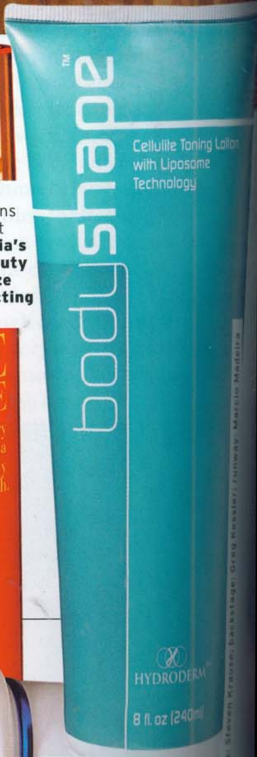
Cellulite Toning Lotion with Liposome Technology

BARE BRONZE Wrap legs in sultry perfection. For a seamlessly sexy airbrushed finish. LEG-PERFECTING SPRAY TINT