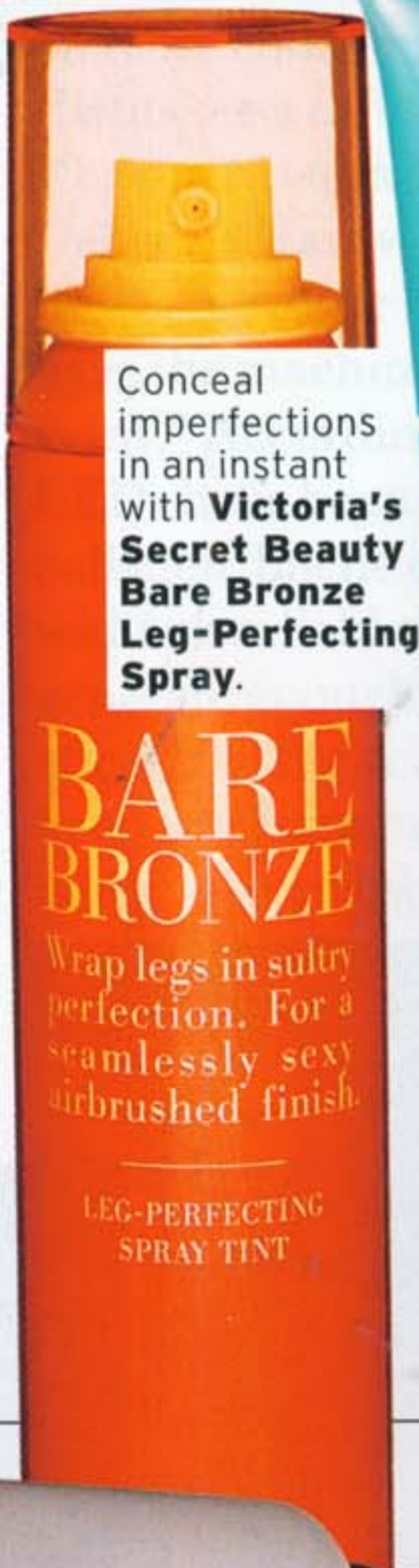
Conceal imperfections in an instant with Victoria's Secret Beauty Bare Bronze Leg-Perfecting Spray .

BARE BRONZE Wrap legs in sultry perfection. For a seamlessly sexy airbrushed finish. LEG-PERFECTING SPRAY TINT