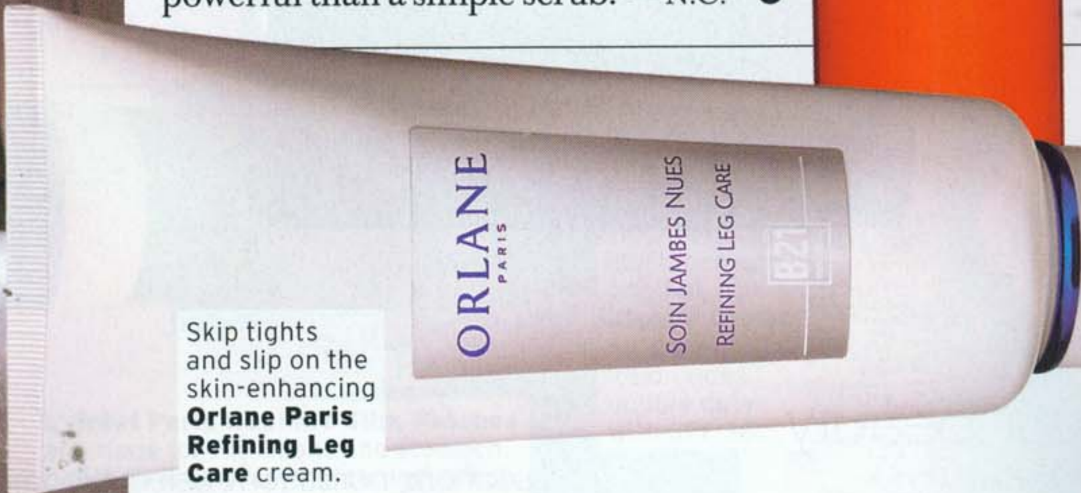
Skip tights and slip on the skin-enhancing Orlane Paris Refining Leg Care cream.